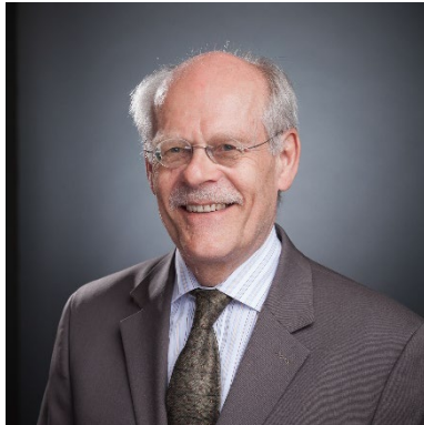
Stefan Ingves Chair, Toronto Centre Former Governor, Sveriges Riksbank

Stefan Ingves is Chair of Toronto Centre's Board of Directors and the former governor of the Central Bank of Sweden. Mr. Ingves previously held the positions of Vice Chairman of the Board of Directors of the Bank for International Settlements (BIS) and Chair of the BIS Banking and Risk Management Committee (BRC).