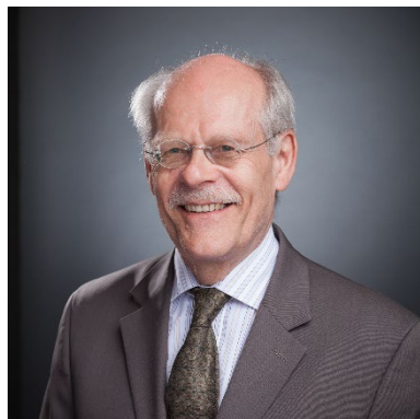
Stefan Ingves Chair, Toronto Centre Former Governor, Sveriges Riksbank